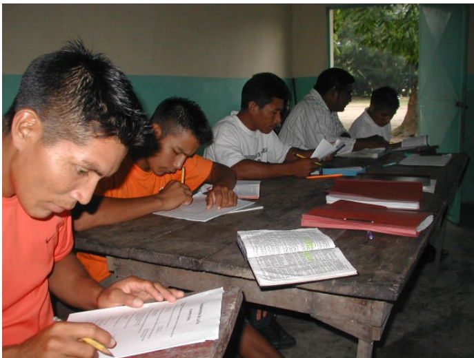
Students at a jungle bible college (in Venezuela I think) using the Harvestime courses to study.

This story has been repeated thousands of times and is the basic work of Cybermissions.