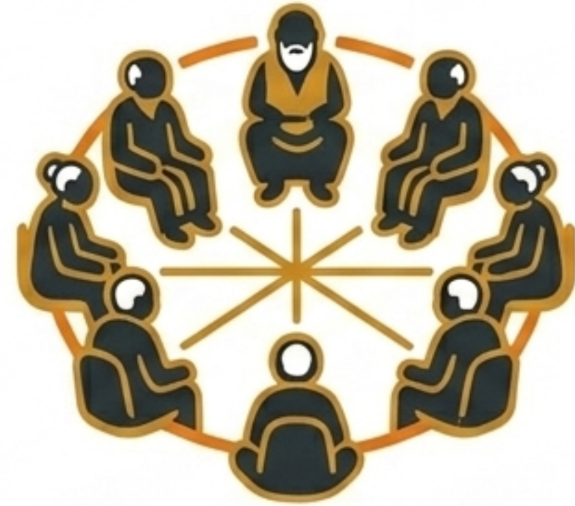
Communal Gathering of Elders

Church organization should reflect natural social patterns (unless unbiblical).